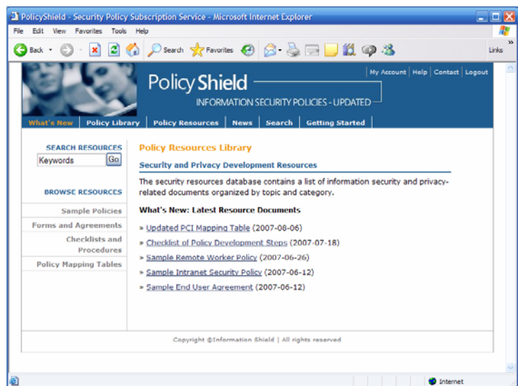
The PolicyShield web-based application interface allows easy navigation and quick searching.